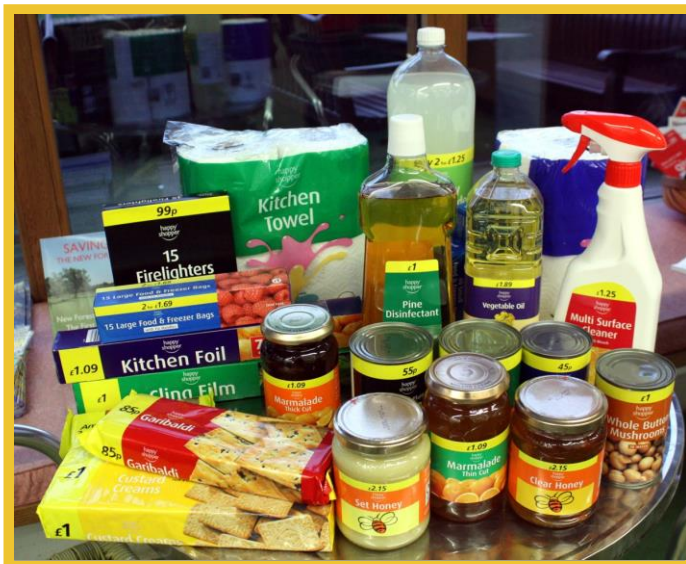
Some of the great value products from our Happy Shopper range