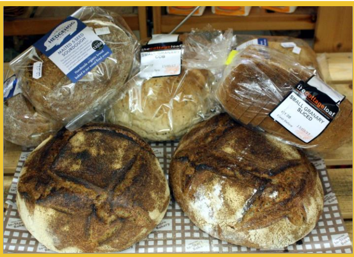
Bread from Cottage Loaf, Hedgehog and Bakehouse 24

That's why we take delivery every day of fresh bread and bakery from Cottage Loaf Bakers, just down the road in Fordingbridge, where bread has been baked since 1900. Sliced, unsliced, white, brown, large, small... you name it, we stock it.